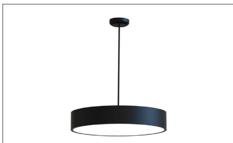
SUSPENDED - STEM