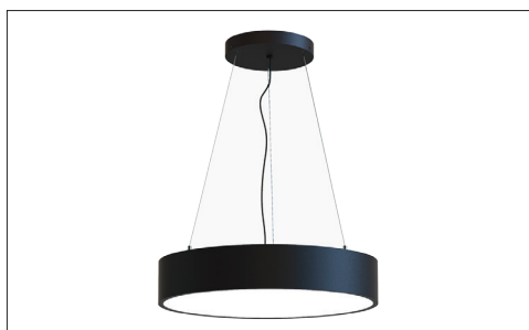
SUSPENDED - CEILING CANOPY