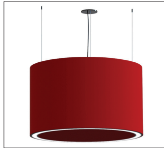
FR - FLUSH REGULAR