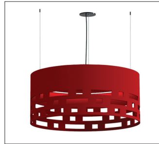
RP - RECESSED PERFORATED