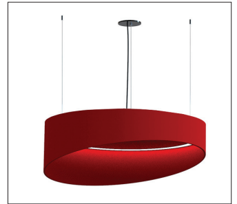
RA - RECESSED ANGLE