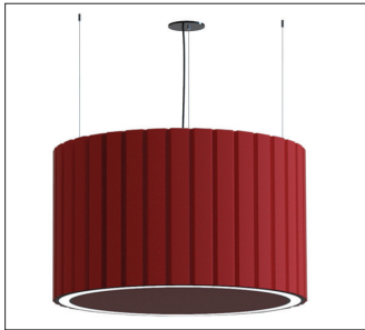
FV - FLUSH VCUT